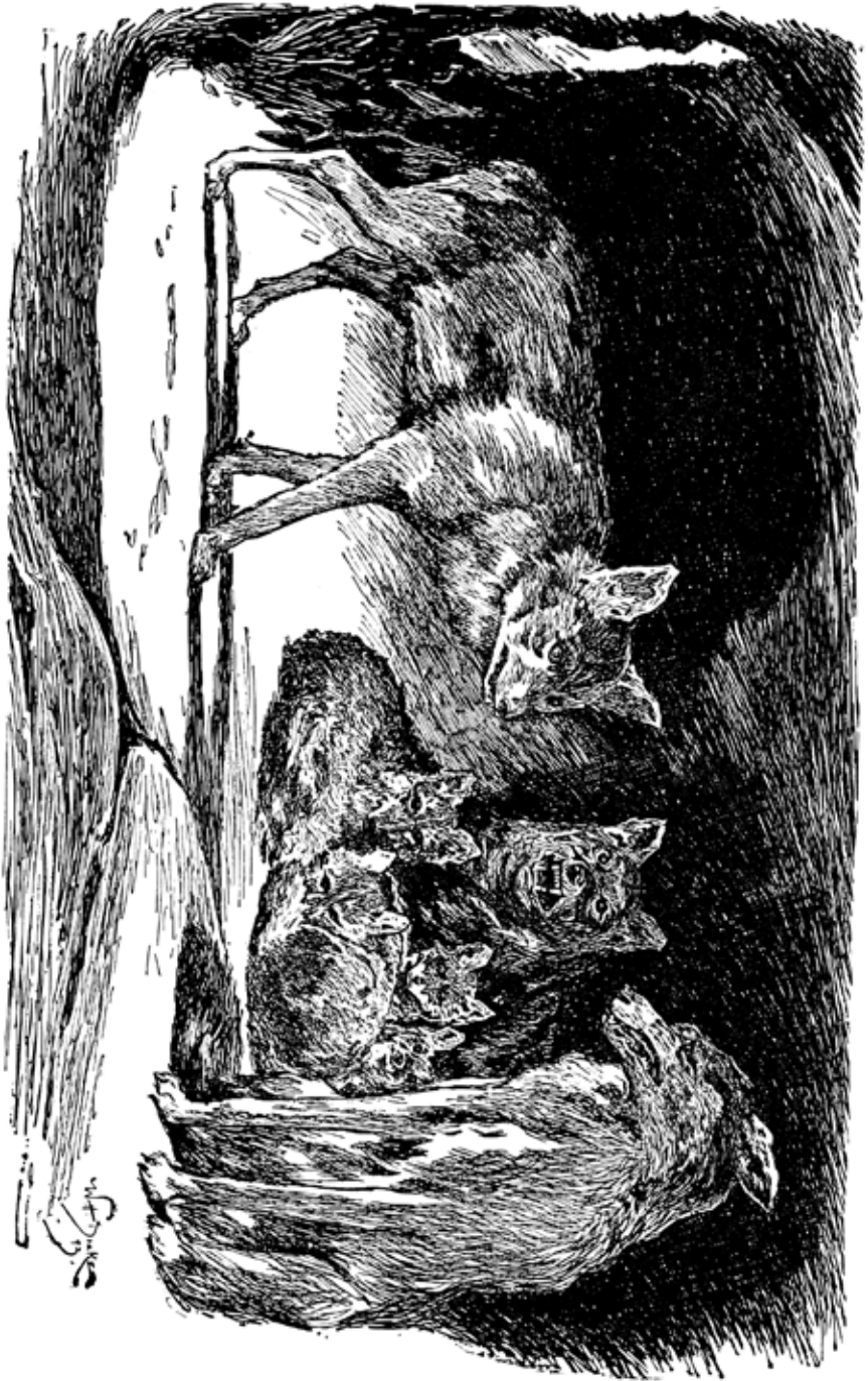
GOOD LUCK GO WITH YOU O CHIEF OF THE WOLVES.