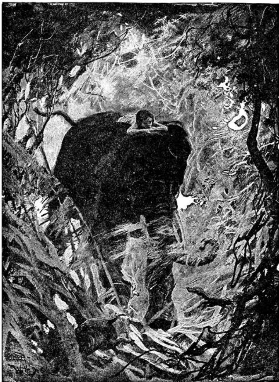
LITTLE TOOMAI LAID HIMSELF DOWN CLOSE TO THE GREAT NECK LEST A SWINGING BOUGH SHOULD SWEEP HIM TO THE GROUND.